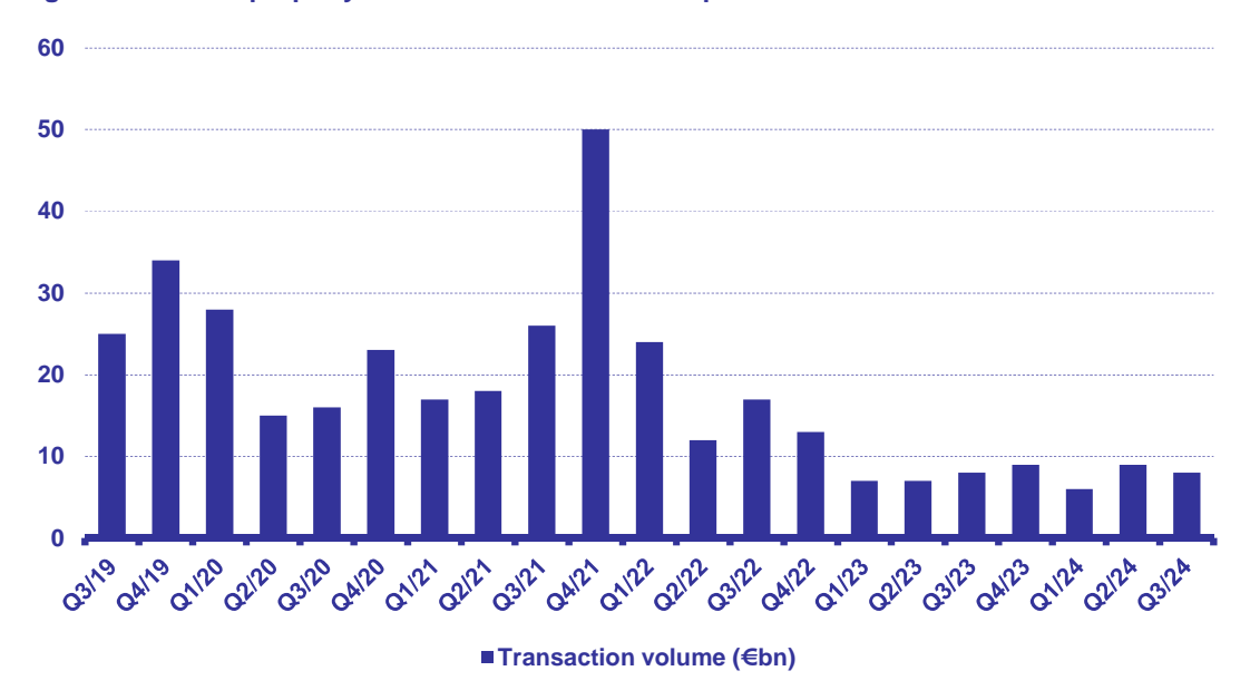
Figure 2: German property transaction volume development